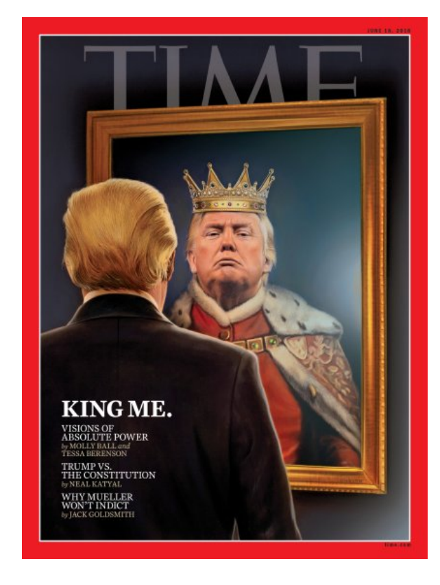
S: June 2018