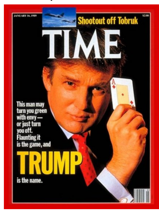
A: January 1989