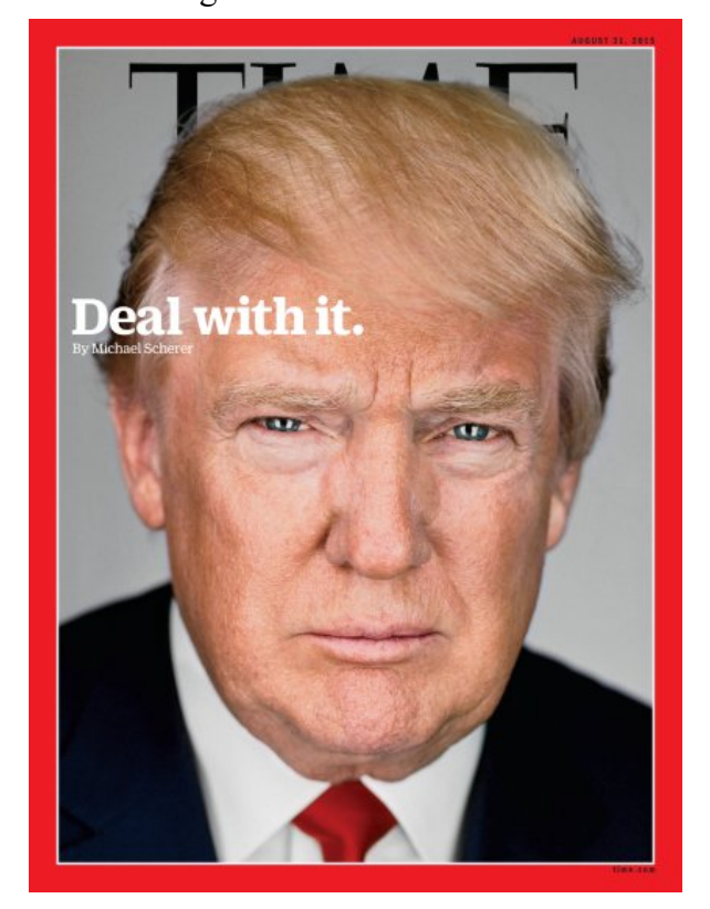
B: August 2015