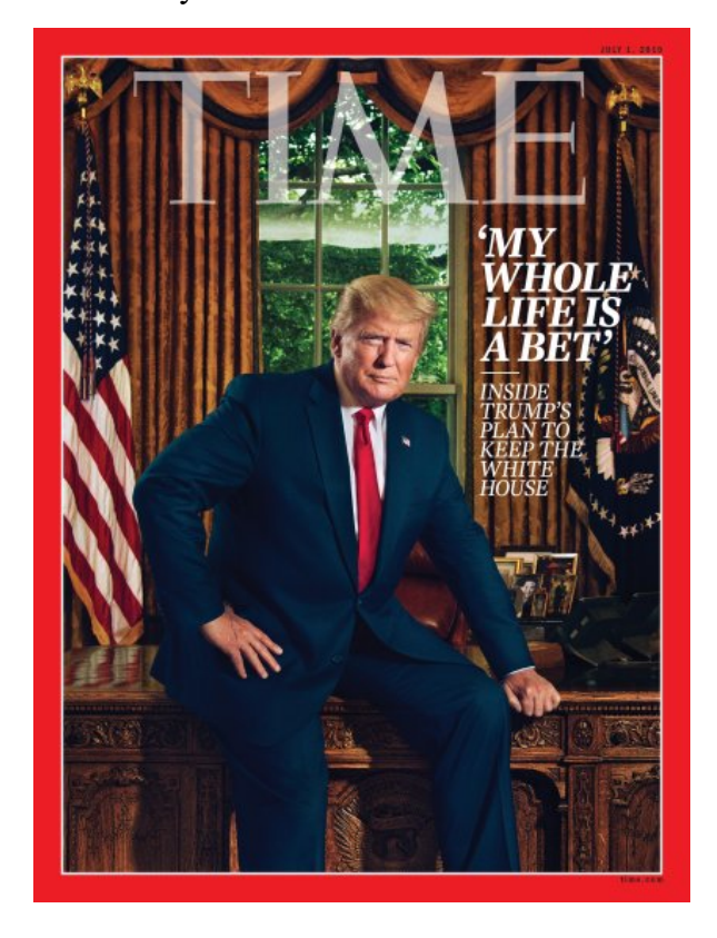
AE: December 2019