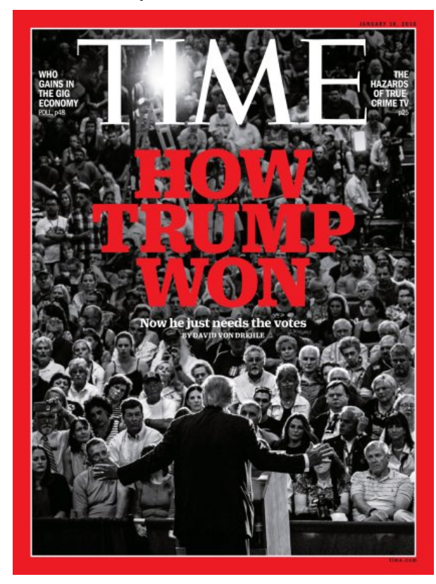
C: January 2016