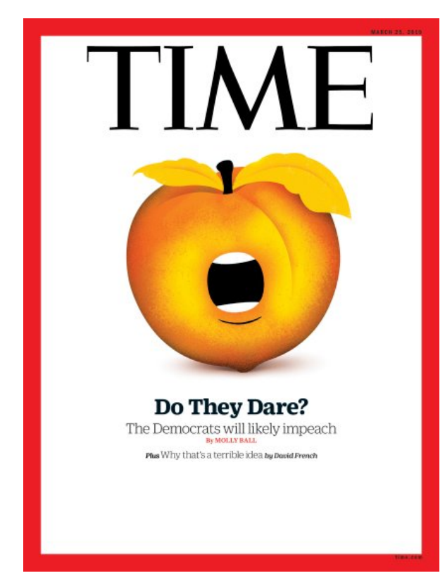
AA: March 2019