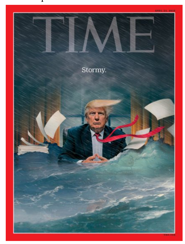
R: April 2018